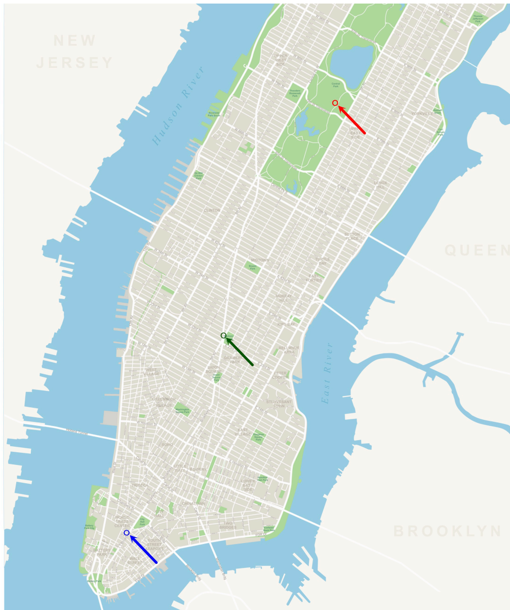
Fig. 2: Locations in Central Park (Mid Manhattan) of Cleopatra's Needle (red circle/arrow) & the Emmet Obelisk in lower Manhattan (blue circle/arrow) & the General Worth Monument (located between the other two (green circle/arrow)).

for short) which will act as a calculator to convert the jumble of coordinates from the NAD27 Datum to the NAD83 (2011) Datum; (it also includes choices for other interim Datums published between 1986 and 2011; plus an estimate to an earlier 1901 Datum known as the US Standard Datum or USSD).